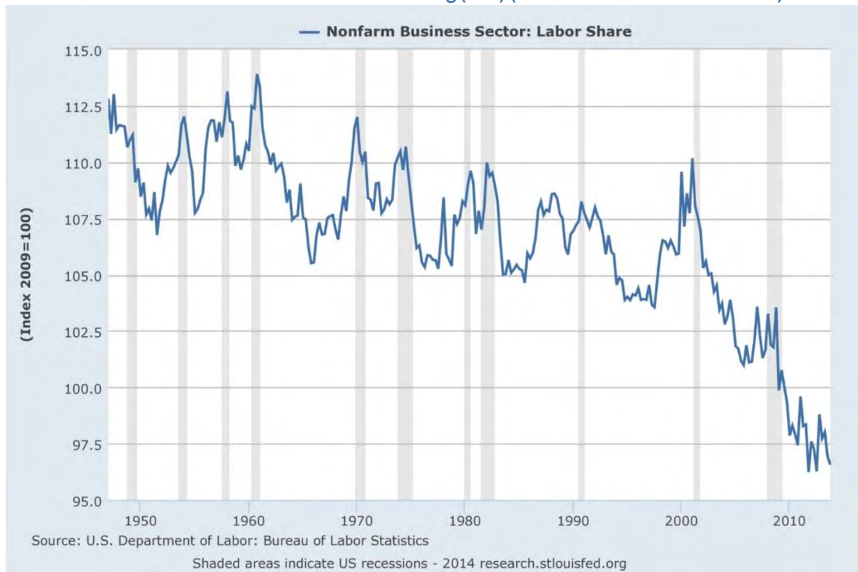
Chart 2: Workers’ Share of National Income is Shrinking (U.S.)

The TPP unduly protects and privileges the “rights” of corporations and investors—even to the point of creating a private system of “corporate courts” (investor-to-state dispute settlement, or ISDS). The result is an ever-widening gulf between the share of GDP going to profits for corporations and the share that workers take home.